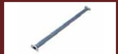
HORIZONTAL LEDGERS Available in 2.00, 1.50, 1.20 and .915 Mtr. Sizes