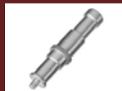
SPIGOTS (JOINT PIN)